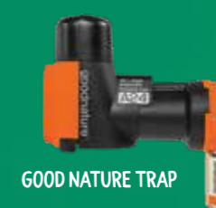
GOOD NATURE TRAP

Goodnature gift $27,000 worth of trapping kit including bluetooth monitored chirps