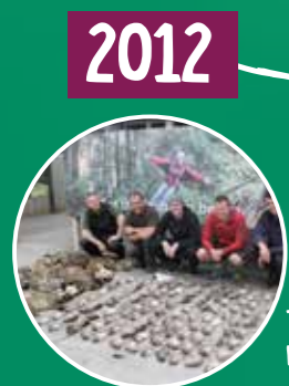
TRAPPING RESULTS FROM THE FIRST NIGHT!

The forest was crawling with pests In the first few weeks OVER 800 PESTS WERE CAUGHT!