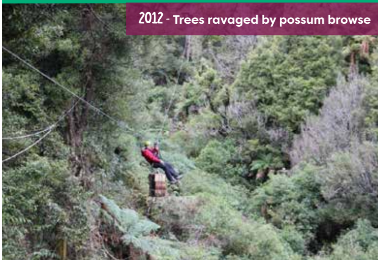
2012 - Trees ravaged by possum browse