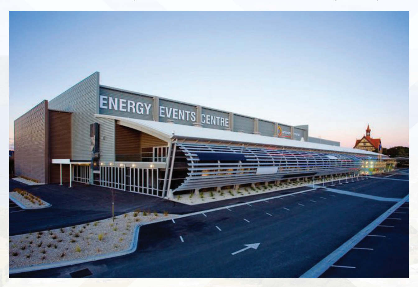
Rotorua Energy Events Centre, Queens Drive, Rotorua 3010, New Zealand

Being an iconic tourism town, Rotorua also offers a comprehensive range of accommodation of all types, including large hotels and exclusive luxury lodges. Downtown Rotorua boasts over 250 shops, and a selection of more than 50 restaurants and cafes to choose from. This is a city filled with adventure and excitement, and there is something to suit everyone.