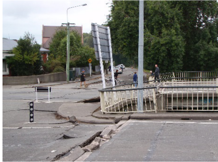
Figure 2: Example of settlement and lateral spreading along the Avon River, Christchurch

attention (see Figure 2). However, to design protective measures against lateral spreading, it is necessary to address some fundamental questions, as yet still unresolved.