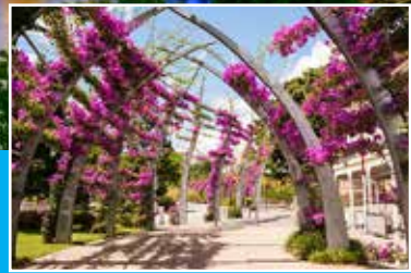
Southbank Grand Arbor