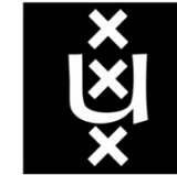
University of Amsterdam