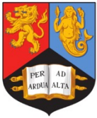
University of Birmingham