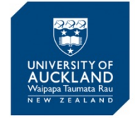
The University of Auckland