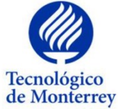
Tecnológico de Monterrey